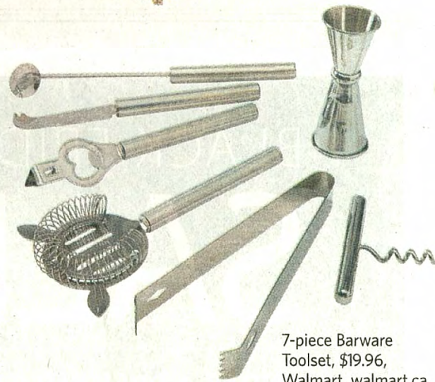
7-piece Barware Toolset, $19.96, Walmart, walmart.ca.