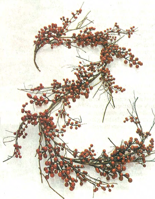
Red berry garland, $69.95, Crate & Barrel, crateandbarrel.ca.