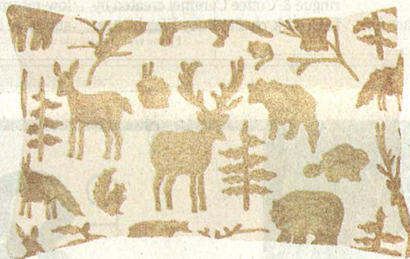
Gold & Ivory Animal Silhouette Pillow, $39.50, Indigo, chapters.indigo.ca.