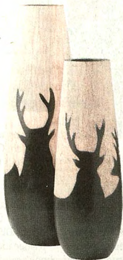
Wood Reindeer Vase, Tall, $39.50, Indigo, chapters.indigo.ca.