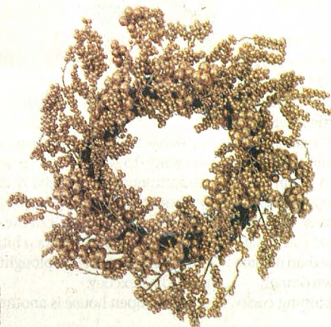
Gold Berry Wreath, $29, Walmart, walmart.ca.